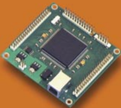
Fig. 1: Integration plate microUSB2