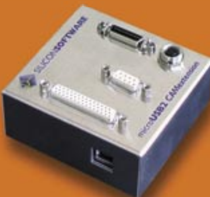
Fig. 2: Mobile frame grabber microUSB2 CAMextension