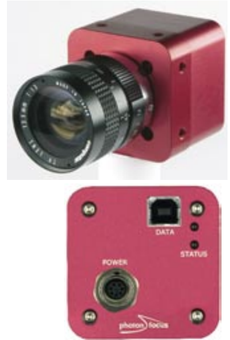
Fig. 3: Photonfocus Kamera with USB2 interface

The company Photonfocus AG has integrated the USB2 interface into its camera series. For its realisation the hard- and software solution was licensed from Silicon Software. The complete integration plate microUSB2 was shrunk to camera size. Hereby, Photonfocus achieved complete compatibility with the external USB2 frame grabber module. Besides